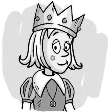
This is James II, King of Scotland. He's ten years old.

In the year 1440, an awful thing happened. At that time it was not unusual to kill people who were in somebody's way. Read this legend, which is more than 500 years old.