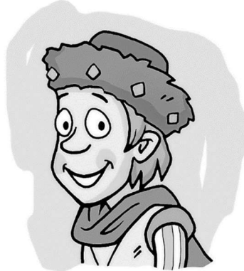
This is William Douglas, the 6th Earl of Douglas. His family is very rich and powerful*.