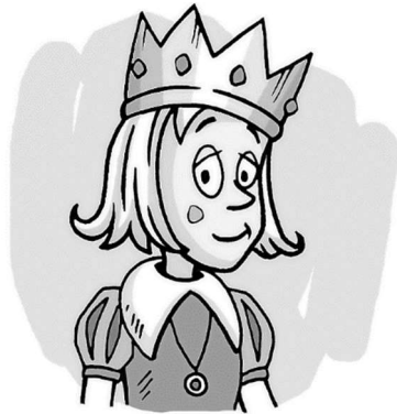
This is James II, King of Scotland. He's ten years old.

In the year 1440, an awful thing happened. At that time it was not unusual to kill people who were in somebody's way. Read this legend, which is more than 500 years old.