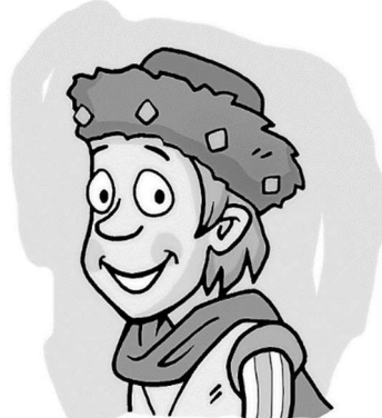
This is William Douglas, the 6th Earl of Douglas. His family is very rich and powerful*.